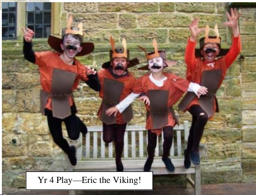
Yr 4 Play—Eric the Viking!