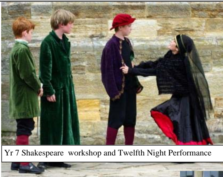
Yr 7 Shakespeare workshop and Twelfth Night Performance

It's that time of year: plays, concerts, plays, musical evenings, trips, sports days and ... oh yes, more plays! So here is a snippet of what's been taking place over the past week or so for Somerhill pupils